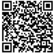
Donate online to St. John the Baptist